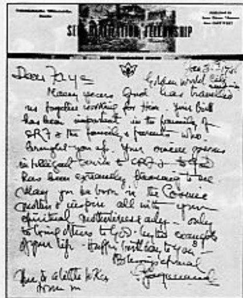
Letter from Paramahansa Yogananda to Sri Daya Mata on her birthday, January 31, 1946

"Many years God has travelled us together working for Him. Your birth has been important in the family of SRF and the family and parents who brought you up. Your sincere joyous intelligent service to SRF and to God has been extremely pleasing to me. May you be born in the Cosmic Mother and inspire all with your spiritual motherliness only—only to bring others to God by the example of your life. Happy Birthday to you. Blessings eternal."